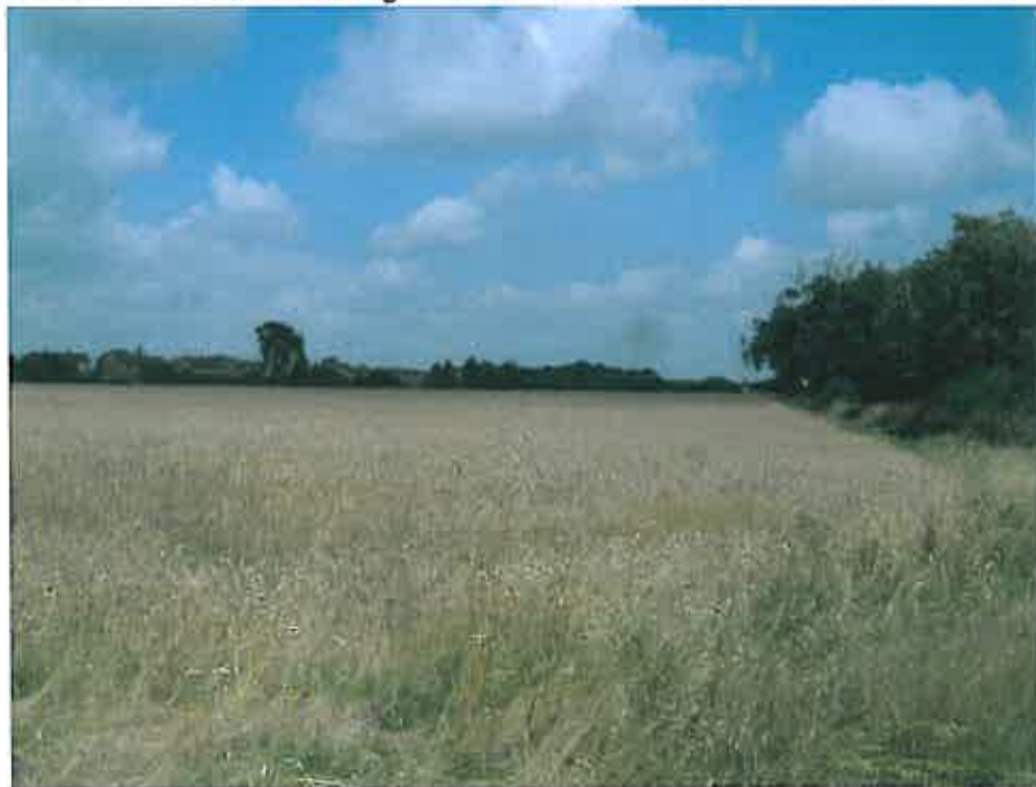
Plate 2: General shot of the site, facing east. The A6 lies immediately behind the trees in the distance. The trees on the right hand side of the shot mark the line of the track that bisects the site.