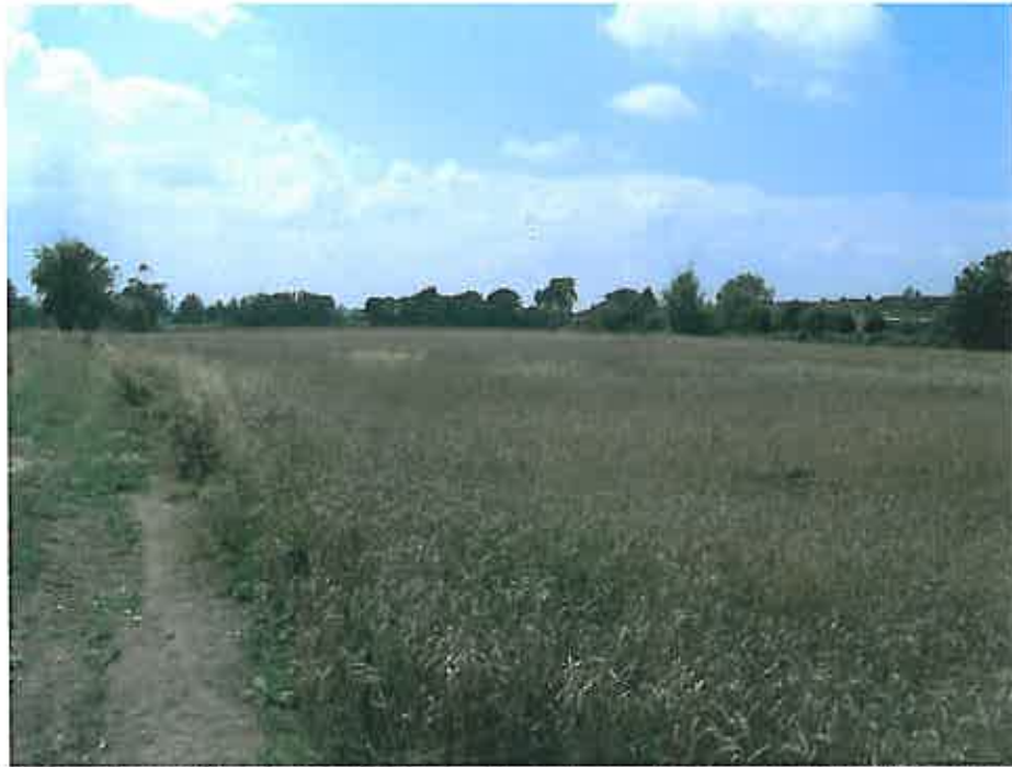
Plate 1: General view of the site looking west. Trees in the distance mark the limit of the site.