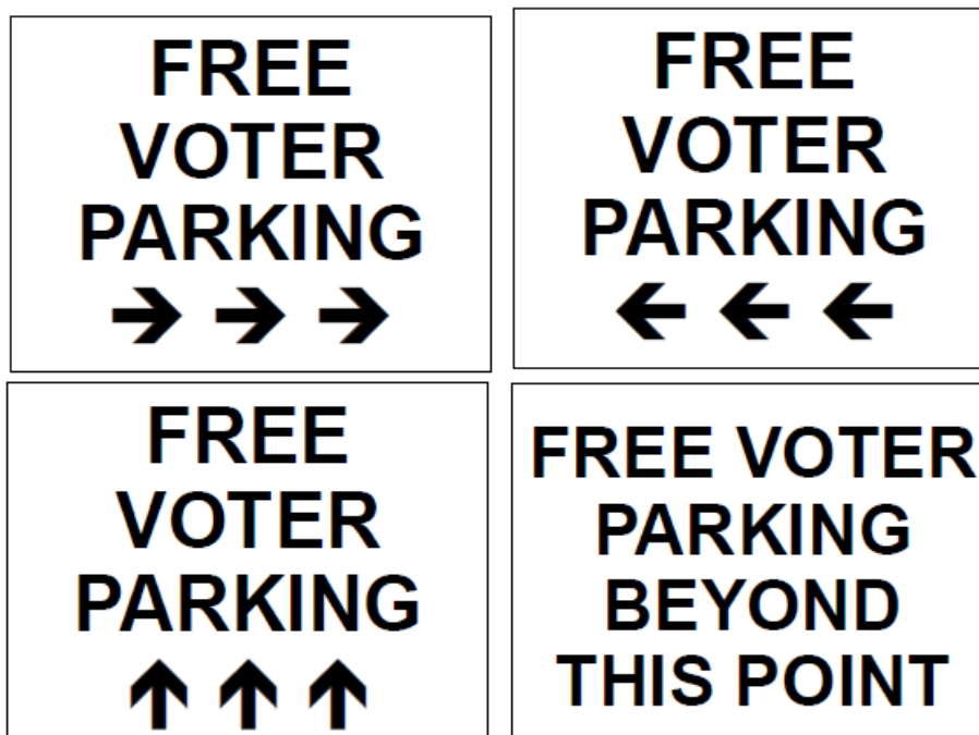
Free Voter Parking Signage

Arrangements will also be made for the message 'Free Designated Parking For Voters' (or similar) to be printed on affected electors' poll cards and for the following additional signage to be procured and erected at Parklands to signpost the free designated parking areas.