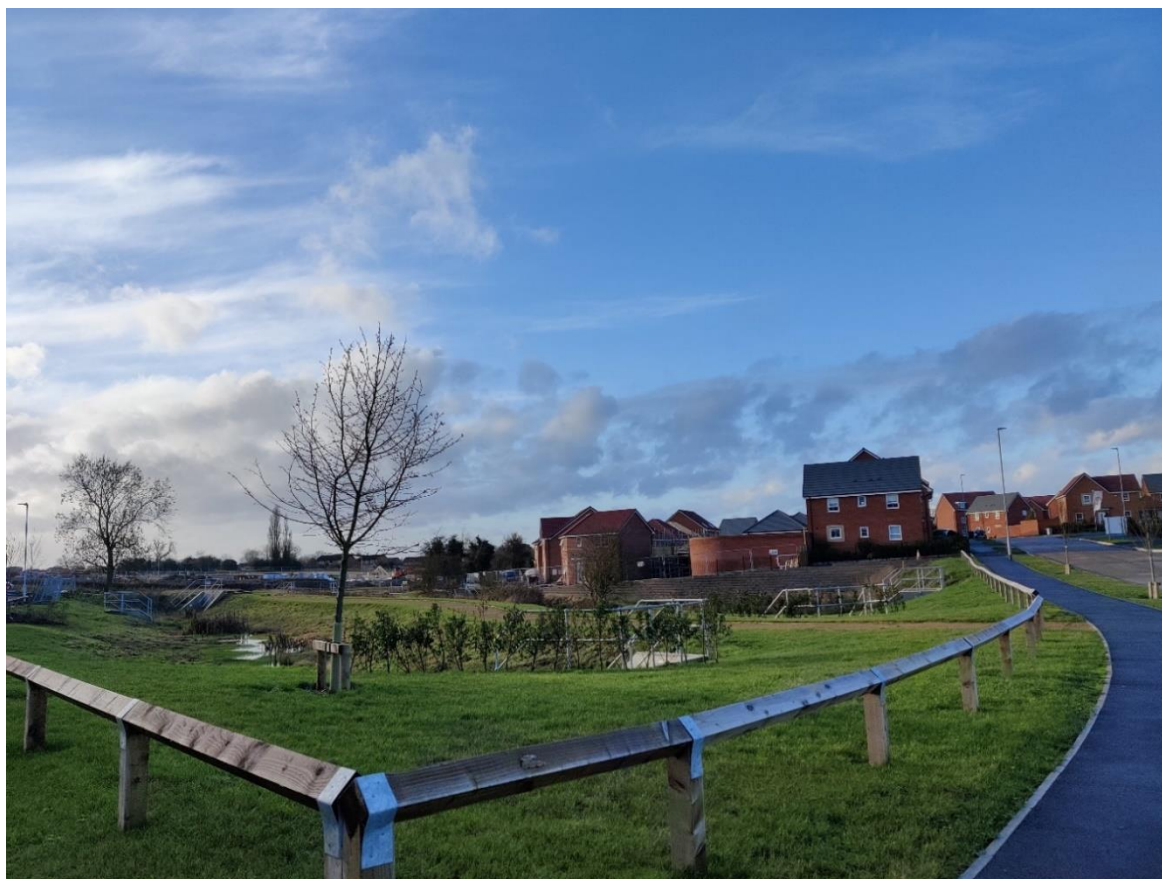
Figure 2. Wigston Direction for Growth