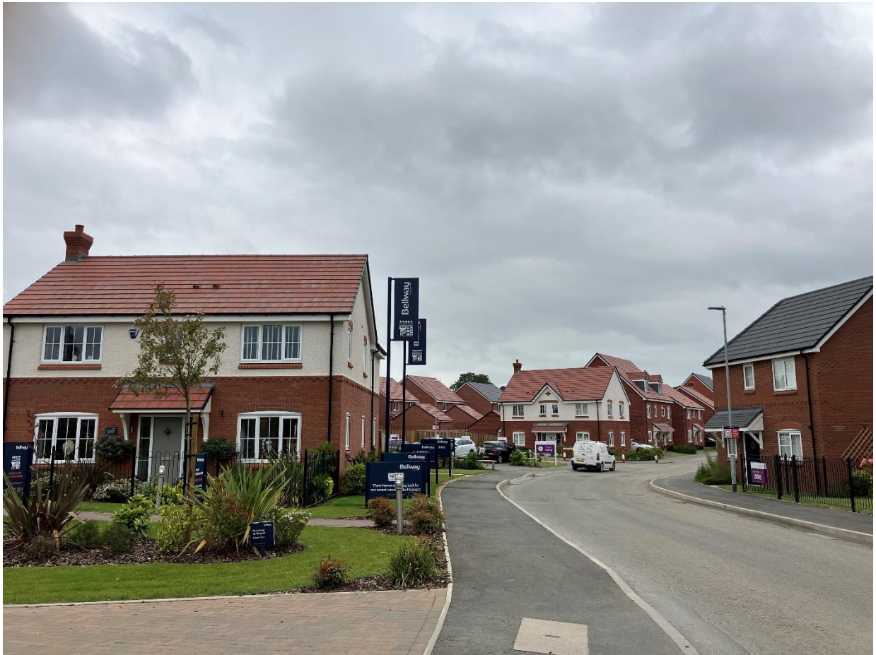
Figure 3. Stoughton Grange Development