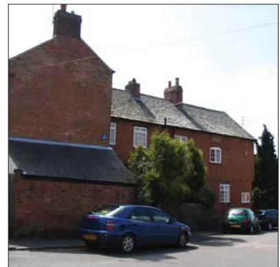
The Chestnuts - 7 Spa Lane