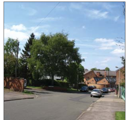
Spa Lane - view west