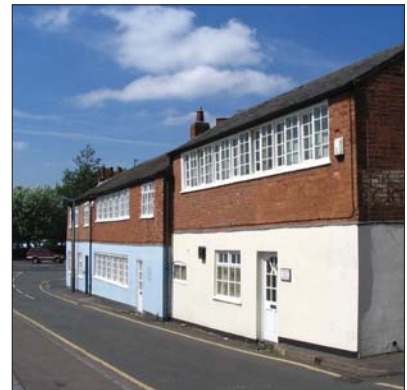
2, 2a and 4 Spa Lane