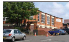
Screening to new service parts of Bell Street commercial units