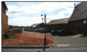
Redevelopment / landscaping of vacant site adjacent to Great Wigston Working Men's Club