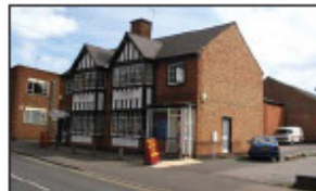
Landscaping of building forecourt